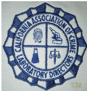
Navy / Navy D